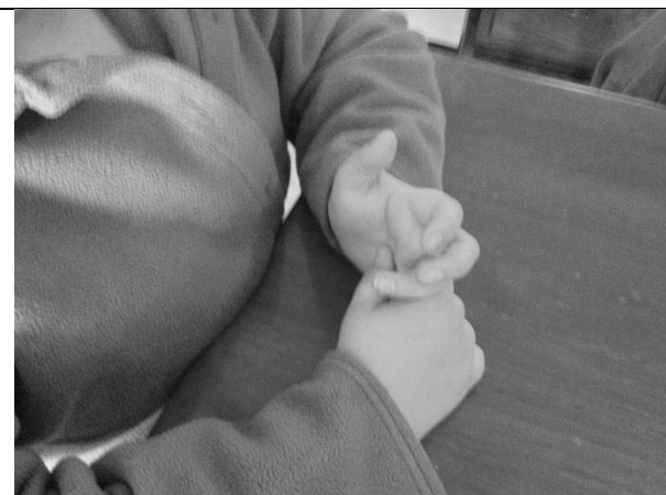
38 We give support