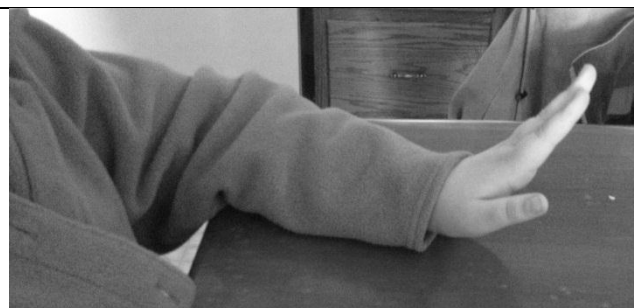
40 Our separate ways