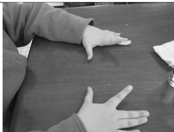
42 In some way